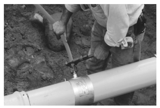
Fig. 10: Angle MUNICIPEX reclaim pipe 10 to 20° above horizontal at connection to main

At the connection between MUNICIPEX reclaim pipe and the reclaimed water main, MUNICIPEX reclaim pipe should leave the main at a 10 to 20° angle above the horizontal, to prevent stress on the connection. This will result in a 'gooseneck' in the pipe that should be at least 4 ft (1.2 m) long. It is not required to use the higher 45° gooseneck common with copper service line.