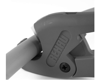
Fig. 9: Plastic pipe cutter

MUNICIPEX reclaim pipe must be cut squarely using an approved plastic pipe cutting tool, such as those sold by REHAU. Do not use a hacksaw or knife to cut MUNICIPEX reclaim pipe, as a rough cut may prevent a secure connection.