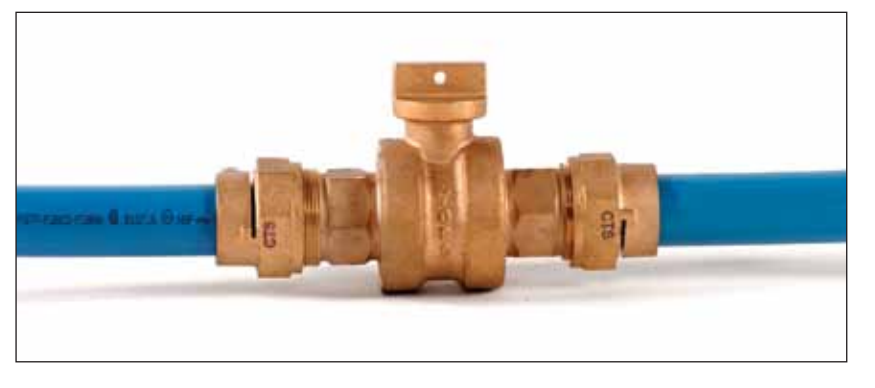
A final assembly with cross-linked polyethylene pipe in a compression joint curb stop that is compliant with AWWA C800, Standard for Underground Service Line Valves and Fittings.

Erosion. PEX pipe has a smooth interior surface and good toughness and can withstand high velocities. Under the test conditions reported in PPI TN-26 (2005), Erosion Study on Brass Insert Fittings Used in PEX Piping Systems, no detectable erosion of the pipe surface occurred at water velocities in excess of 12 fps. Design velocities are generally restricted by factors other than the PEX pipe (i.e., valves, fittings).