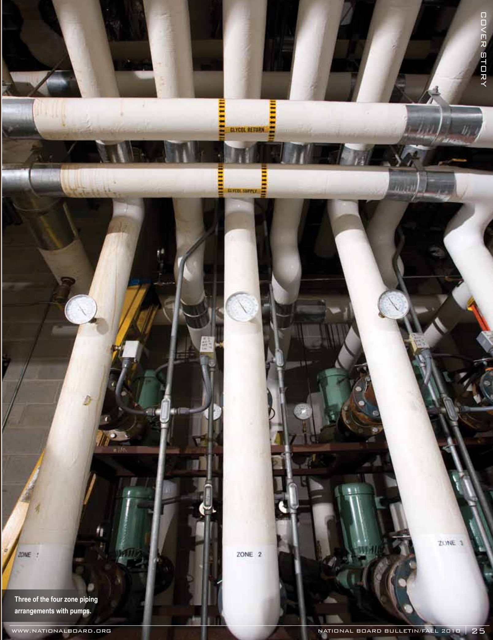
Three of the four zone piping arrangements with pumps.