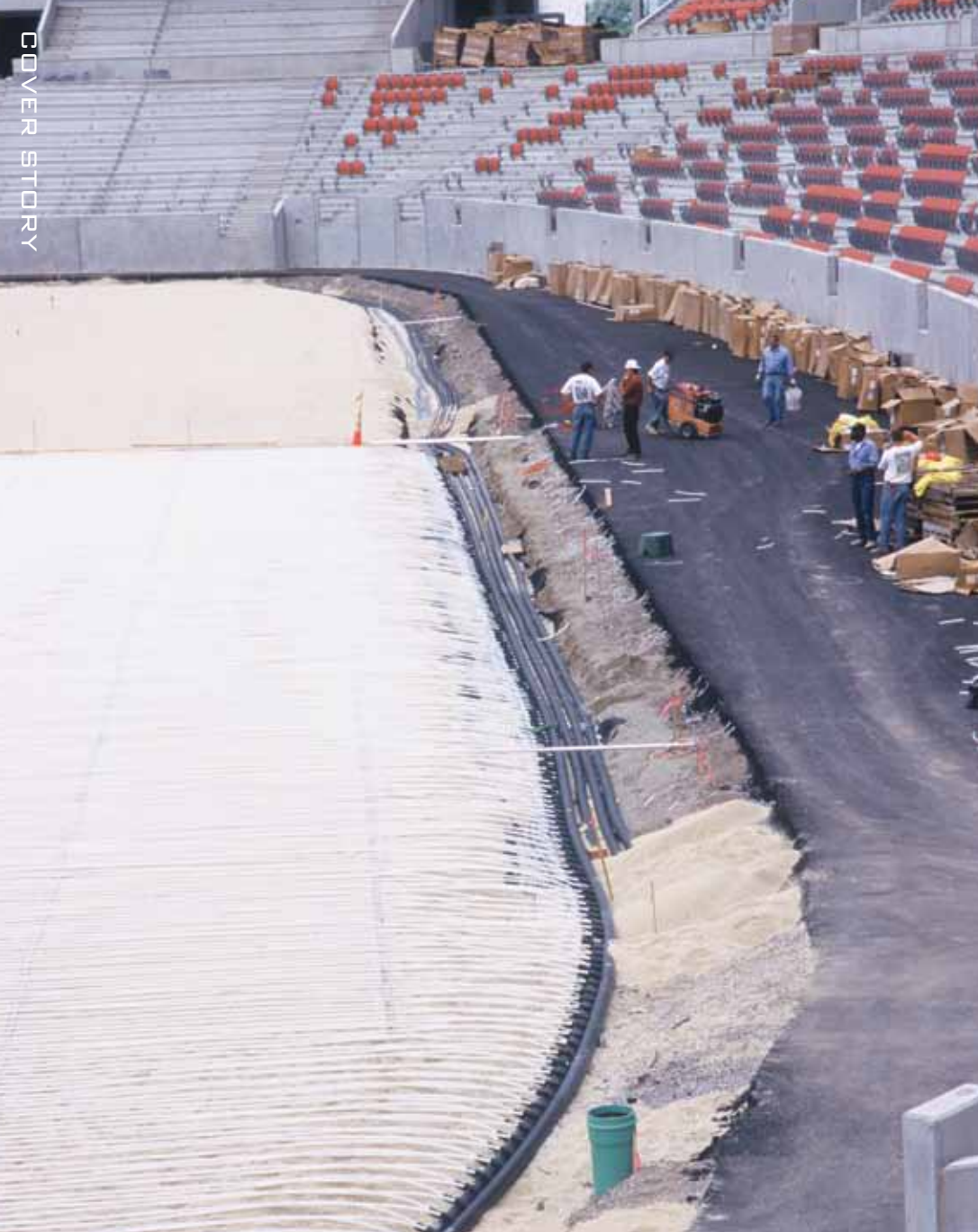
LEFT: Installation of PEX tubing (white) to main manifold (black) at Browns Stadium.