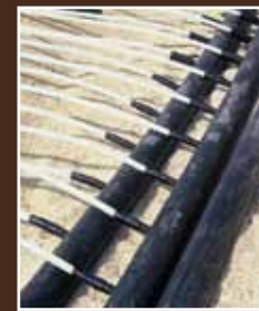
ABOVE: Tubing connections to the manifold.