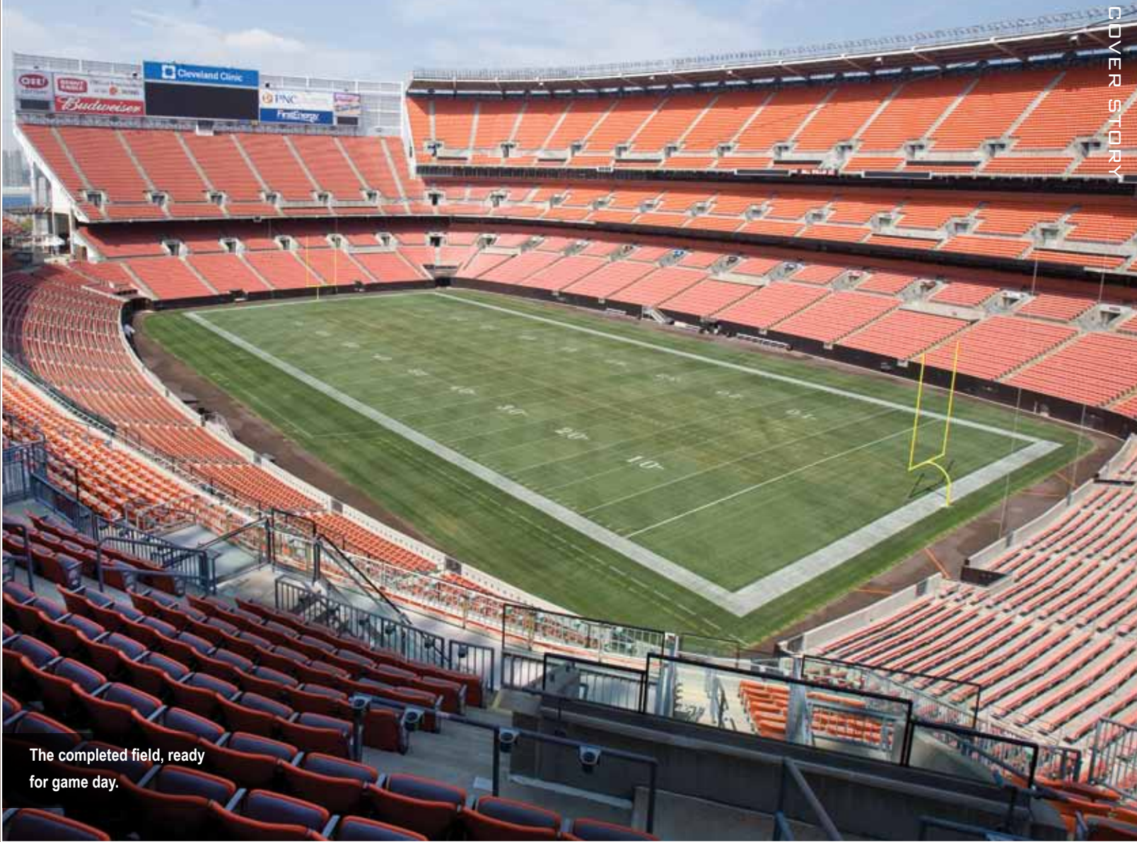
The completed field, ready for game day.

down to a few areas and literally dug along until we found it. Luckily we haven't had any leaks since then," says Pate.