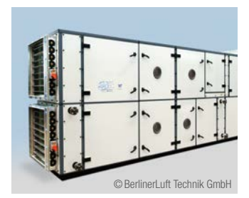
Air conditioning and ventilation technology