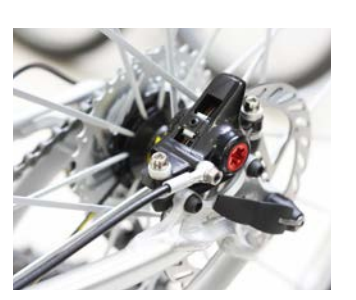
Sport and leisure