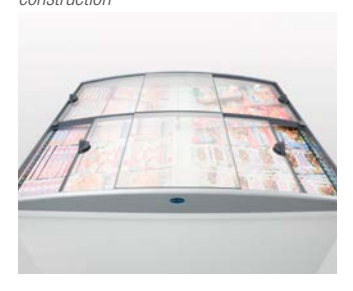
Commercial cooling / domestic appliance industry