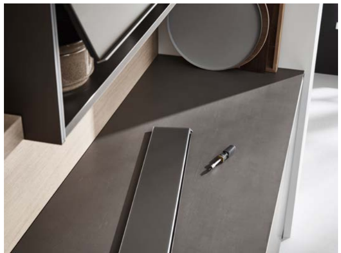
The slats can be individually replaced by the service team.