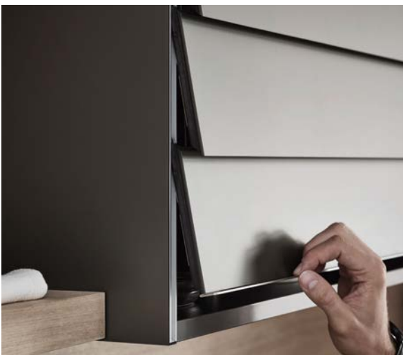
The magnetic catch provides a satisfying sound when closing.