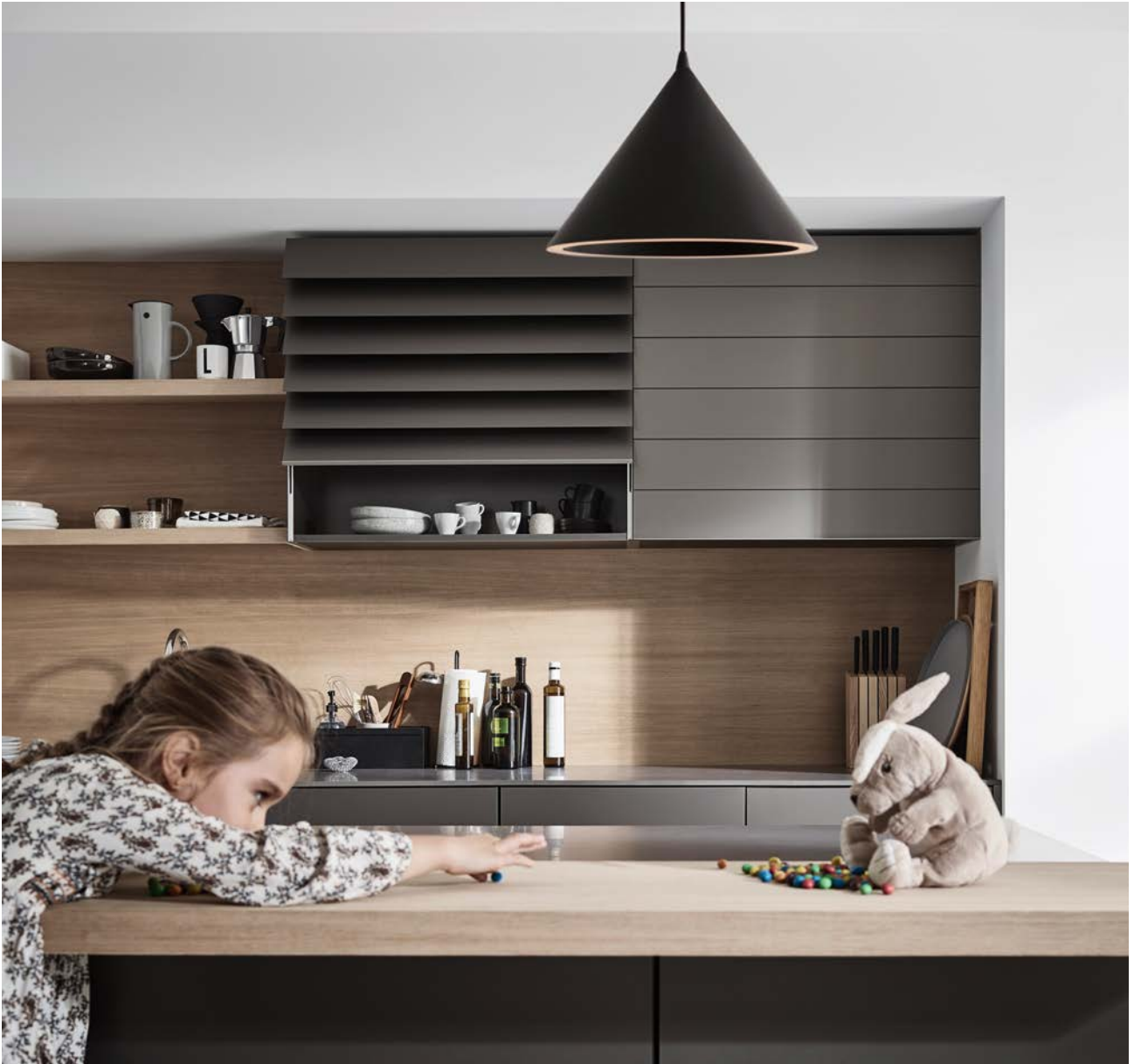
The chamfered edge of the slats create a unique appearance.