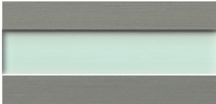
2233E Stripe mint-Stainless steel