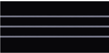
2236E Lines blue-black