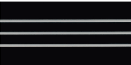
2235E Lines white-black