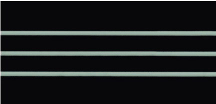
2237E Lines mint-black