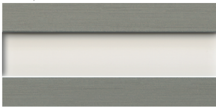
2231E Stripe white-stainless steel