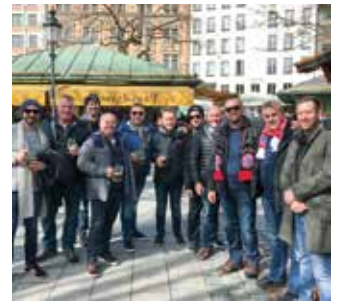
Strolling along Munich’s popular market en route to the kick off at the football.

“A very well organised and informative tour. Much appreciated.” Anthony Rebesco • Ecosmart Plumbing & Drainage