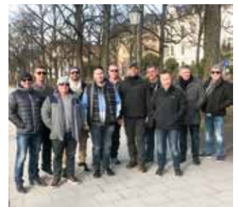
Discovering the city of Munich and sampling produce on a Sunday afternoon.