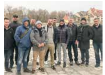
Medieval city tour along the Danube river at Regensburg, one of Germany’s oldest, most well-preserved towns.