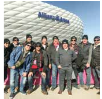
Enjoying the atmosphere and getting ready for kick off at Allianz arena, Munich.