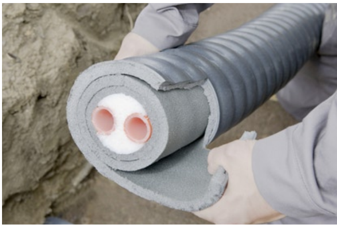
Easy to lay: three-layer ready-insulated local heating system pipe for flexible use on sites where space is short