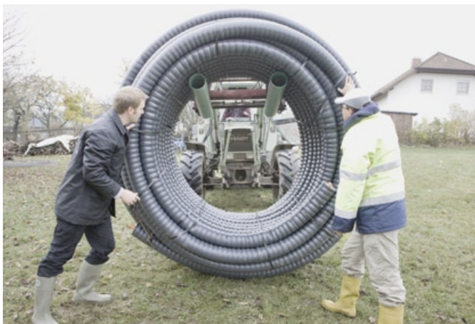
Efficient laying: pipe system in long coils or site-specific cut lengths

The new ready-insulated local heating pipe system for a touch more reliability, flexibility and efficiency!