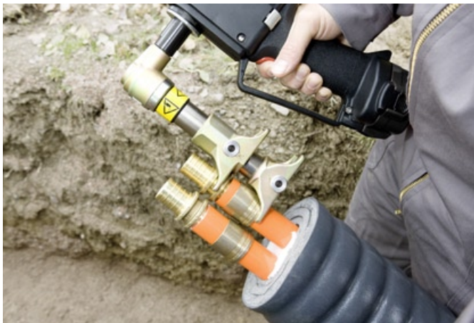
Easy to connect: medium pipe with tried and tested REHAU compression sleeve jointing technology