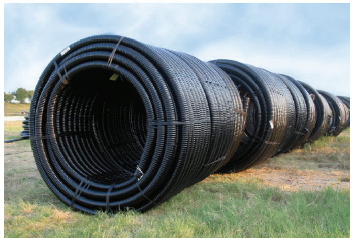
MUNICIPEX Pre-insulated coils ease installation

MUNICIPEX is rated for continuous use at operating conditions up to 200 psi @ 73.4°F (1,380 kPa @ 23°C) using a 0.63 design factor.