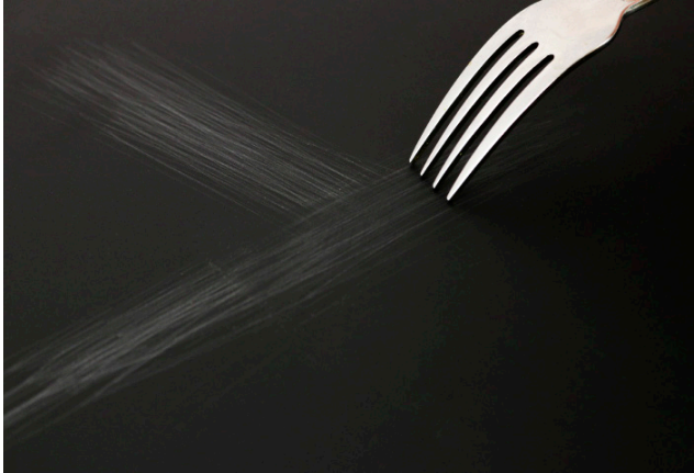
Scratches caused by metal fork

RAUVISIO noir is a highly resistant and durable surface with the ability of thermal healing. Micro-scratches will heal independently or healing can be escalated with friction or heat.