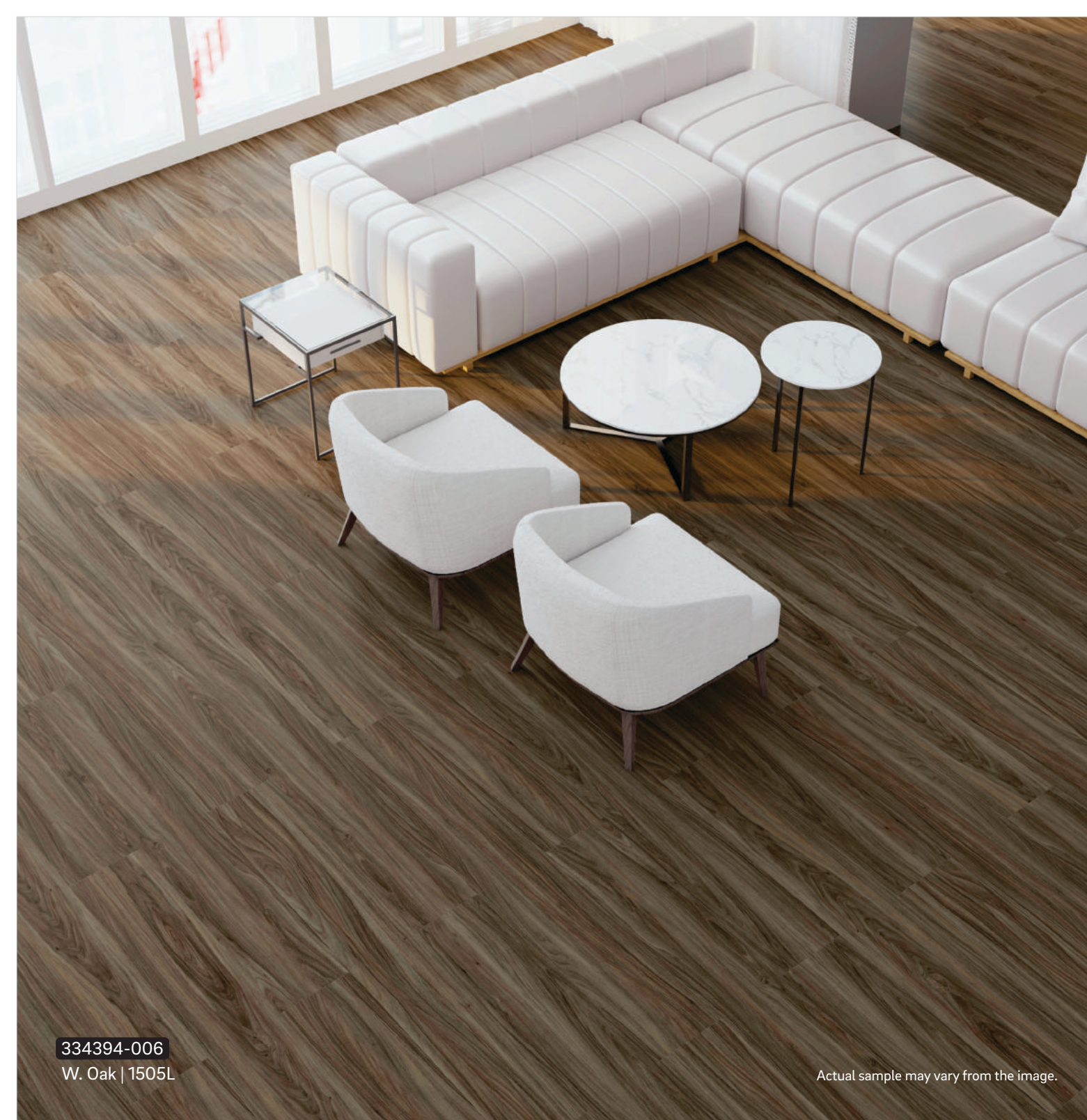
334394-006 W. Oak | 1505L