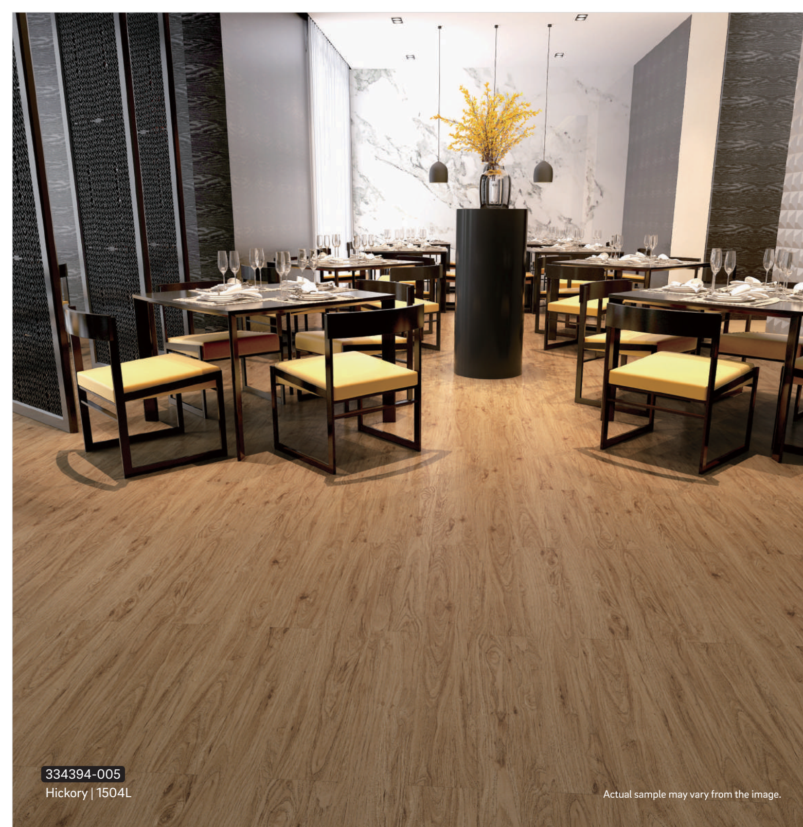
334394-005 Hickory | 1504L