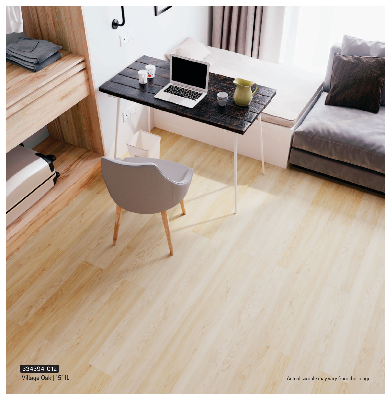
334394-012 Village Oak | 1511L