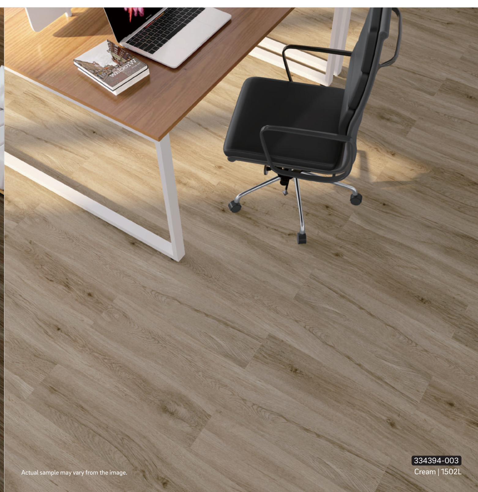
334394-003 Cream | 1502L