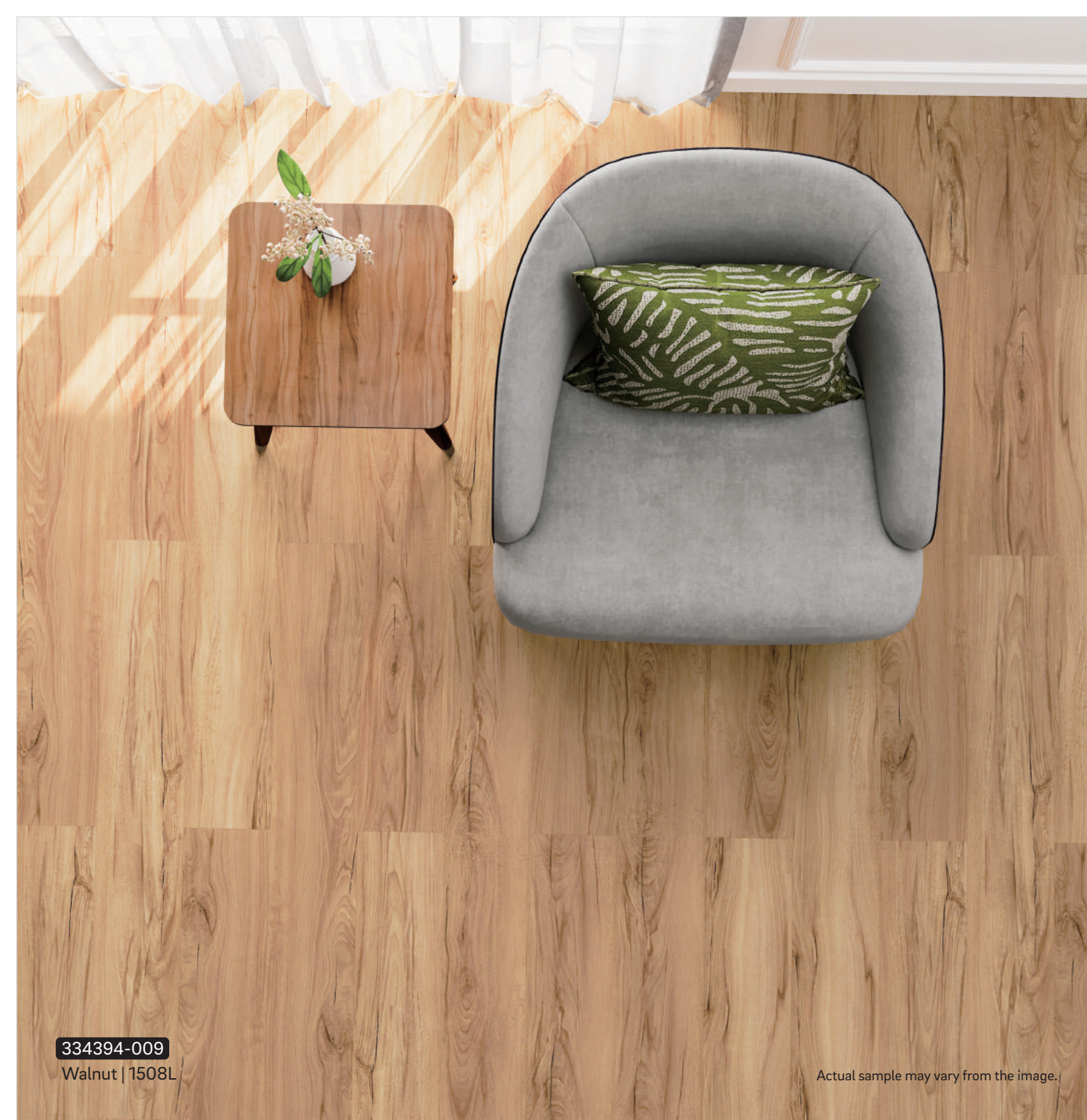
334394-009 Walnut | 1508L