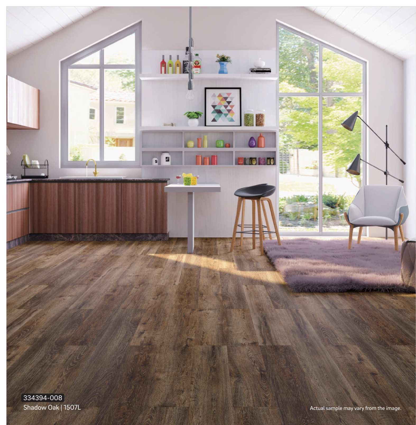
334394-008 Shadow Oak | 1507L