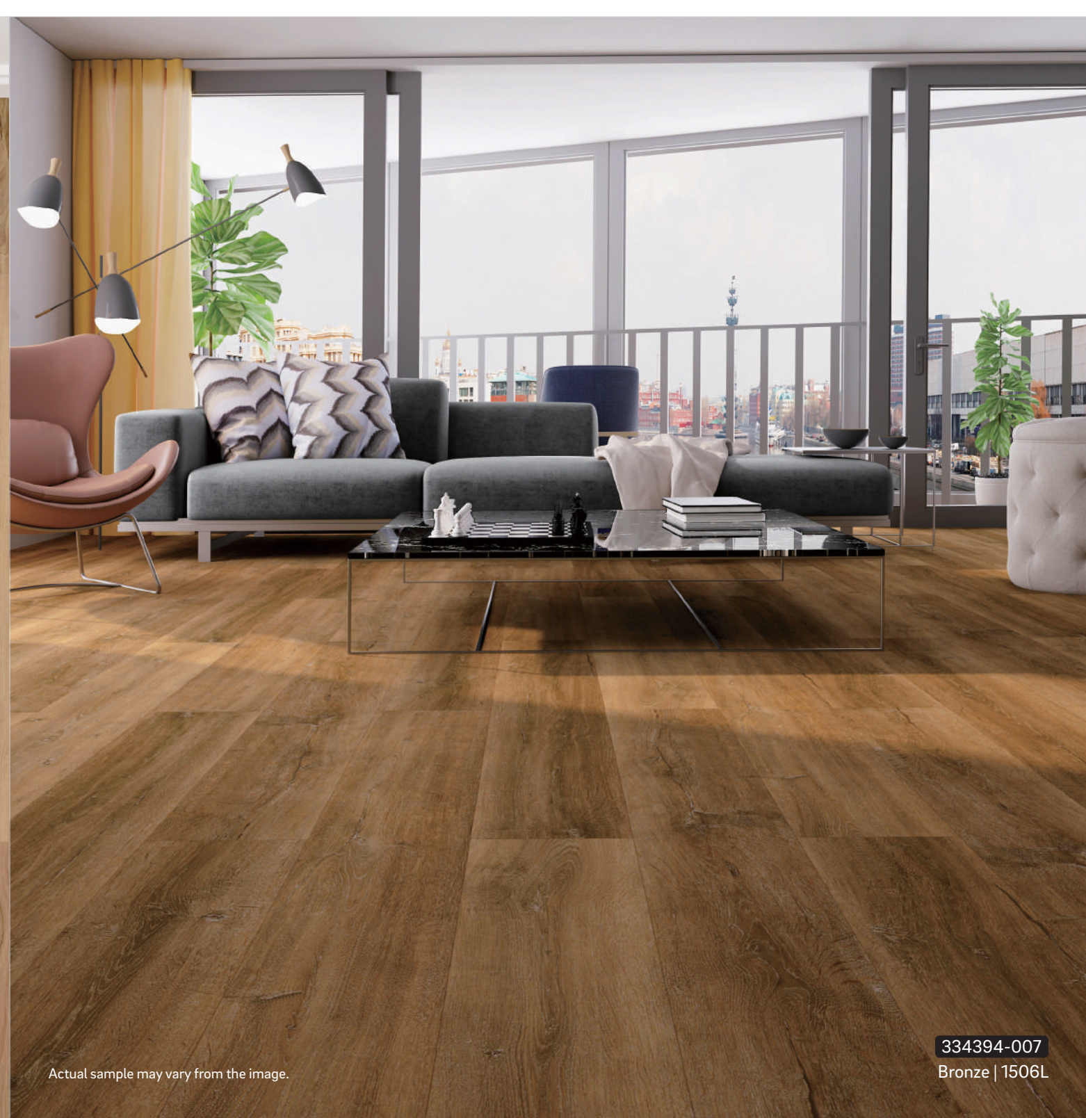
334394-007 Bronze | 1506L