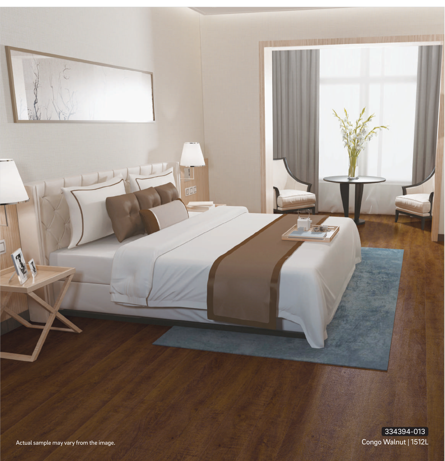
334394-013 Congo Walnut | 1512L