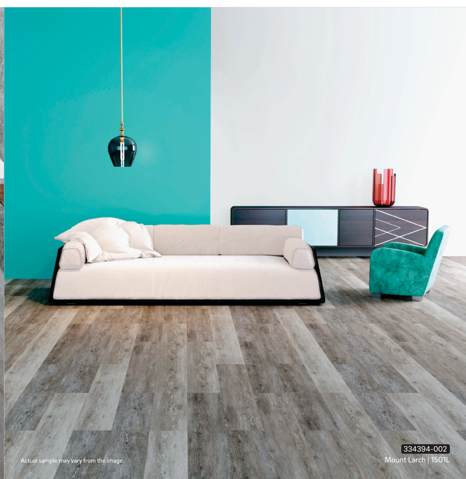
334394-002 Mount Larch | 1501L