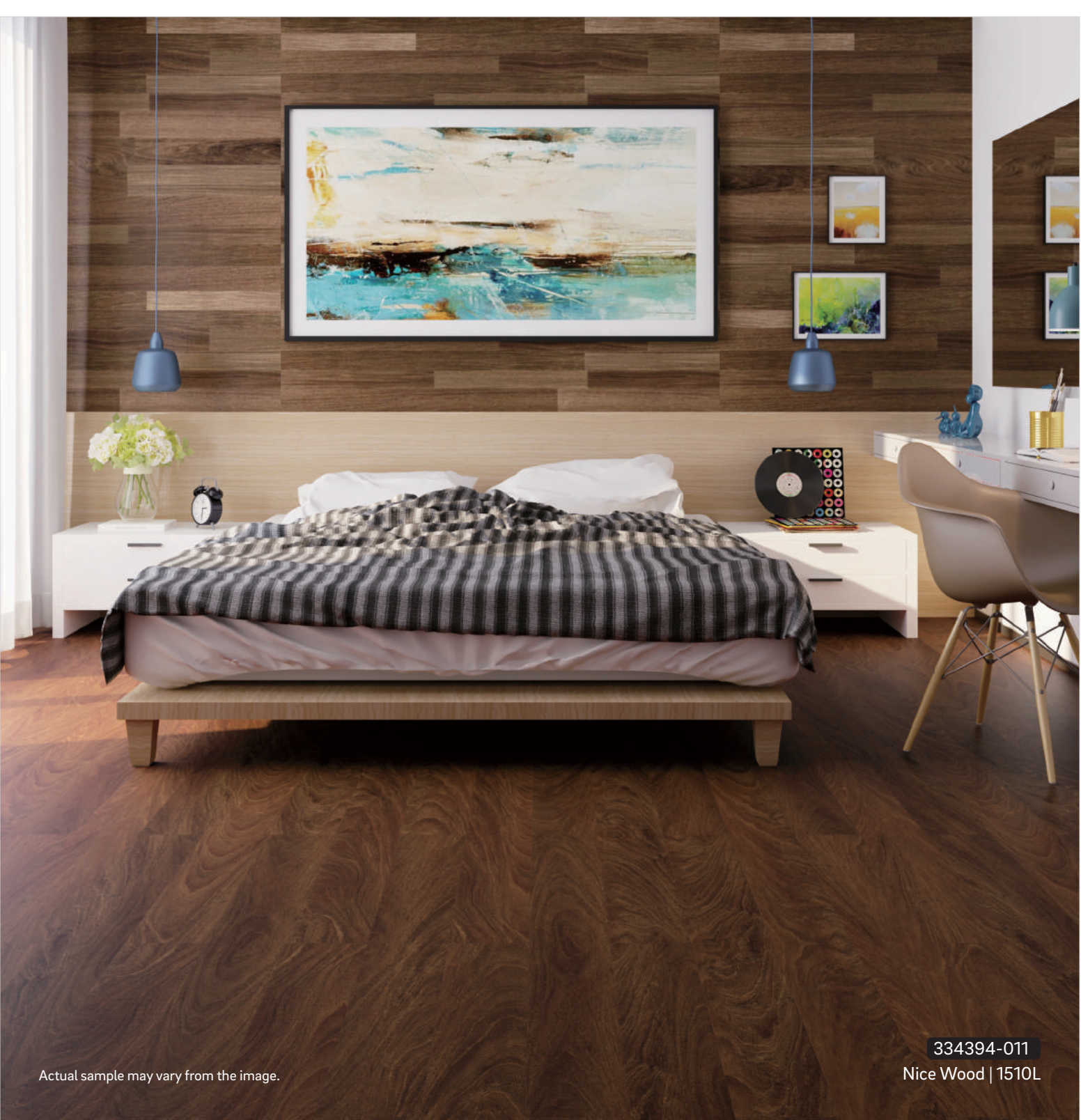
334394-011 Nice Wood | 1510L