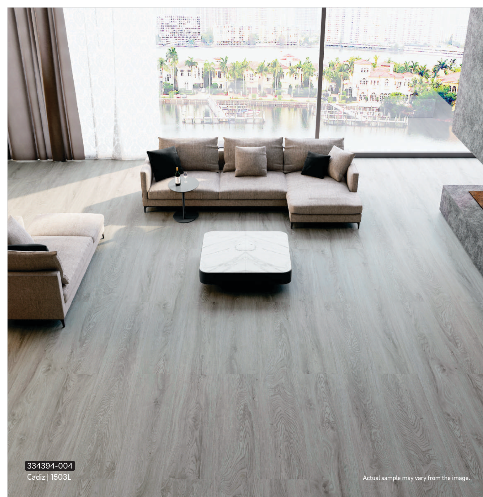
334394-004 Cadiz | 1503L