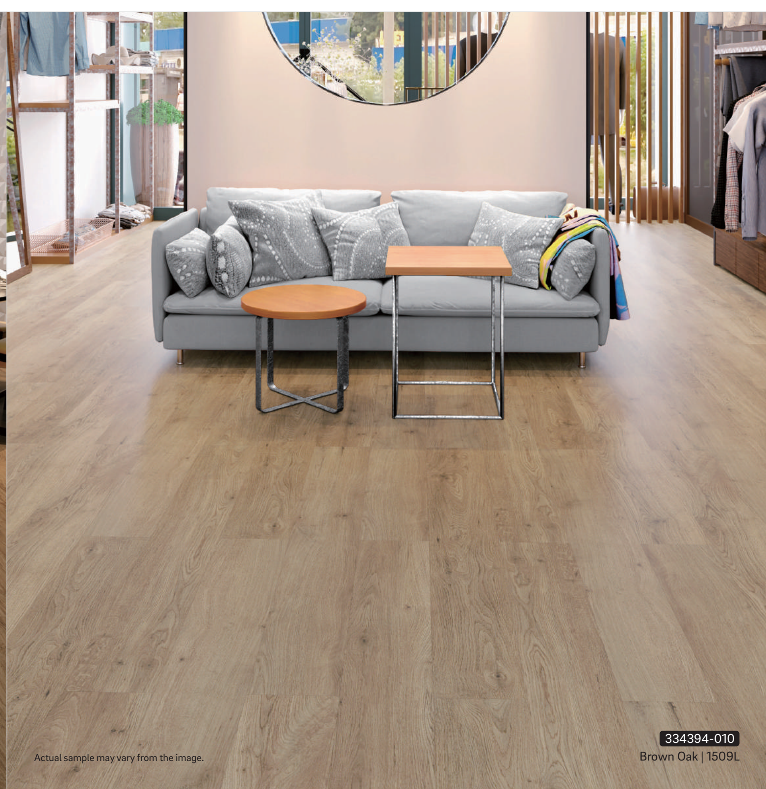
334394-010 Brown Oak | 1509L