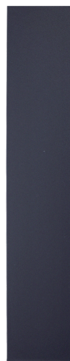
RAUKANTEX Edel Matt