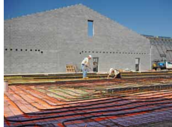
Watts Water Technologies provided 32,000 linear ft. of 3/4-in. Watts Onix synthetic rubber tubing for the West Friendship Fire Department in Howard, Md. Eliminating the potential for costly slips and falls are a key reason for installing snow-melt systems.