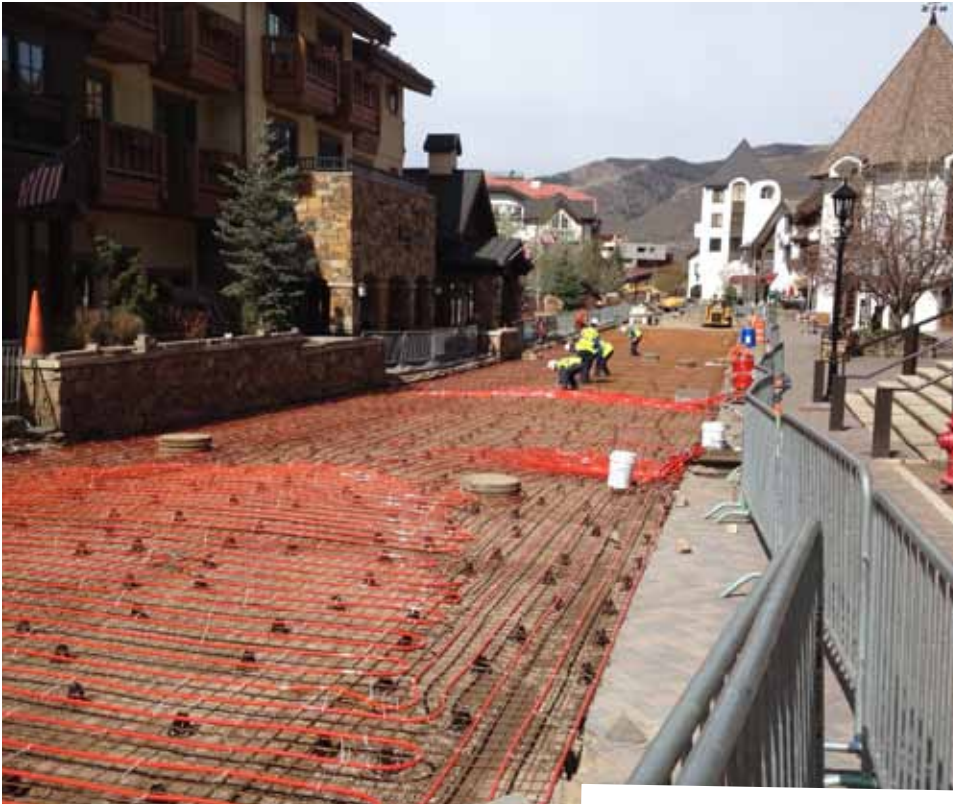
Above: Workers install REHAU plastic pipe for the snow-melt system at the Solaris Residences in Vail, Colo. Inset: The snow-melt application at Solaris won REHAU a Plastic Pipe Institute Building and Construction Division 2011 "Project of the Year" award.

Snow-melt systems are becoming more advanced and popular in commercial settings.