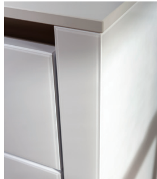
Beveled edge trimming is the new standard for RAUVISIO crystal high gloss and matte surfaces. This will give the surface a beautiful finish, exposing the edge of 'glass.'

Any gem or rock can be beautiful on its own, in its rawest form. The nuances of a piece – its colors, variations and reflections – are what make it unique and appealing to the eye.