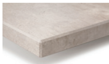
The RAUVISIO crystal Stone Collection stays on trend with the industry's most popular patterns (featured above) and is now available in a beveled edge to create a sleek and modern finish.