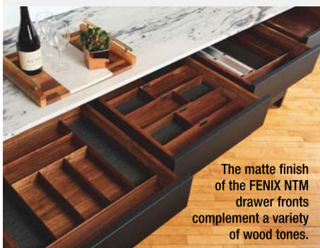
The matte finish of the FENIX NTM drawer fronts complement a variety of wood tones.

"As the modern trend picks up in North America, we want to make it easy for every cabinet maker to offer frameless cabinets that rival the best in European cabinetry," said Collins. "With high-quality seamless slab-front doors, online ordering, delivery in about a week and no MOQs, we're removing all of the barriers to entry."