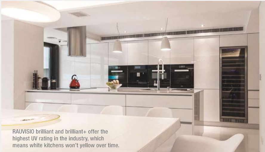
RAUVISIO brilliant and brilliant+ offer the highest UV rating in the industry, which means white kitchens won't yellow over time.