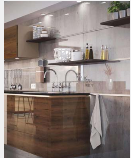
[Above] High-gloss cabinets like REHAU's RAUVISIO radiant provide a unique, modern look in the kitchen.

Saturated colors – from deep navy to metallic graphite – as well as custom colors, are all finished with the brilliant+ mirror high gloss.