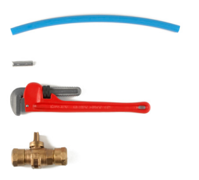
Fig. 9: Standard tool and connections

▲ CAUTION! All fittings and valves used with MUNICIPEX pipe for water service must be certified according to NSF/ANSI 61 for drinking water safety to avoid adverse health effects.