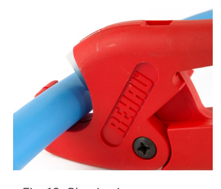
Fig. 10: Plastic pipe cutter

No special tools are required for MUNICIPEX connections when using AWWA C800 compression joint connections. Standard pipe wrenches may be used with these connections, as permanufacturer's instructions.