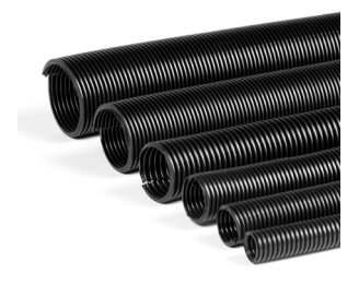
Fig. 5: Flexible PE sleeving

freezing of the water inside the pipe while the ground around it is below 32°F (0°C). However, water inside a pipe surrounded by frozen earth can eventually freeze. Therefore, it is a good design practice to install all service line pipes, including MUNICIPEX, below the frost line.