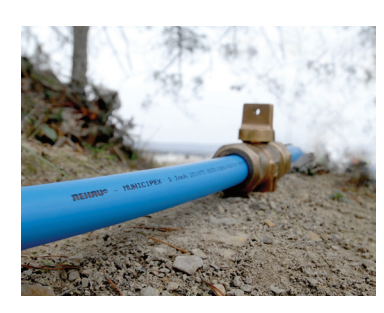
Fig. 6: Trench bottom

Where suitable soil conditions exist and the trench bottom soil can be graded without difficulty, MUNICIPEX may be installed directly on the prepared trench bottom. The trench bottom must provide continuous support, and be free of hollows, lumps, rocks, debris or other hard materials which could damage or kink the pipe. Any irregularities must be leveled off and/or filled with tamped material.