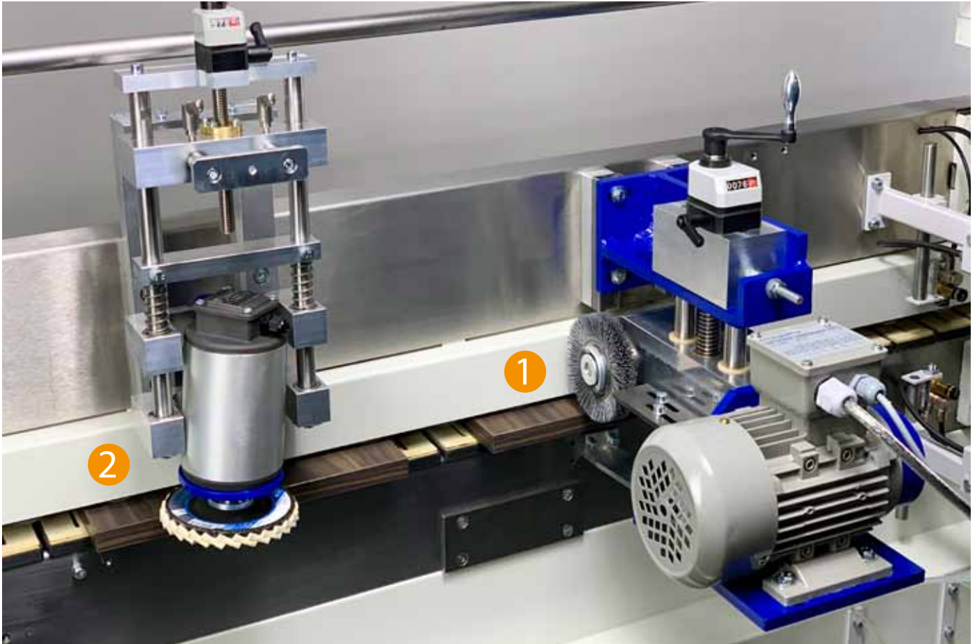
(1) Structuring brush unit (2) Horizontal brush unit