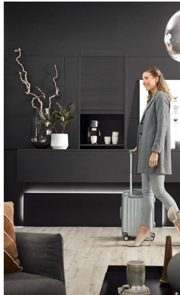
Perfectly coordinated design