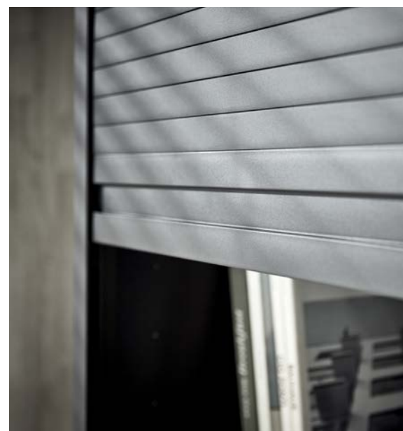
A matt look from every angle

Storage solutions to suit every taste, without compromising on functionality – that’s the aim of our ‘The art of storage’ collection. Whether it’s noble matt, glass-effect or metal tambour doors or a FLIPDOOR system – you can decide which cabinet is right for you. Matching surfaces and edgebands complete the look.