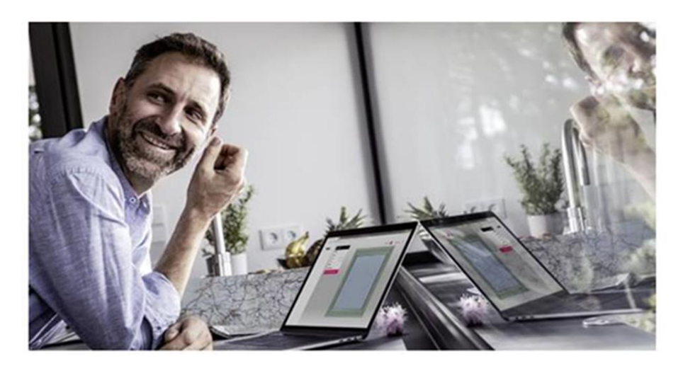
Step by step instruction - How to build an AGILA composite door