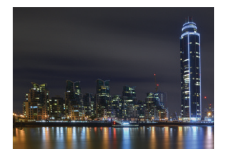
The Tower, 1 St. George Wharf Size: 210 apartments Product: Heating and plumbing