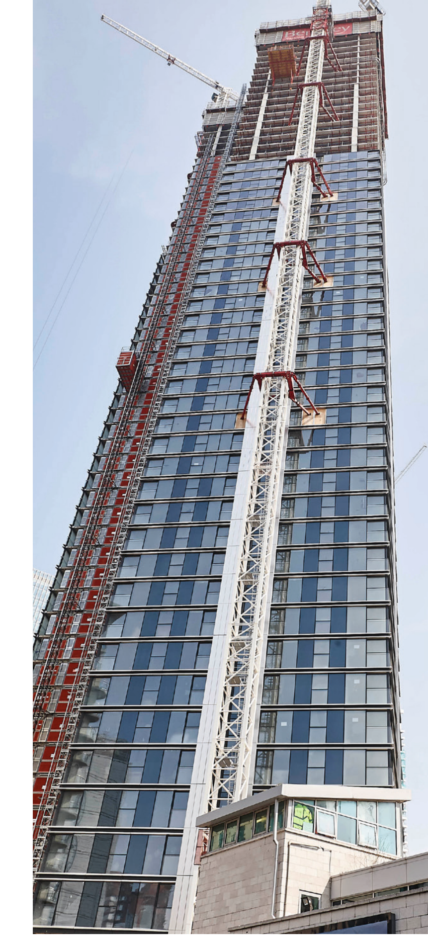
South Guay Plaza Size: 685 apartments, across 67 floors Product: Underfloor heating