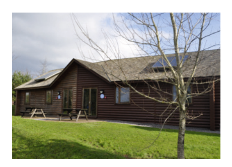
Bluestone Holiday resort Size: 65 eco-friendly lodges Product: RAUTHERMEX pre-insulated pipe