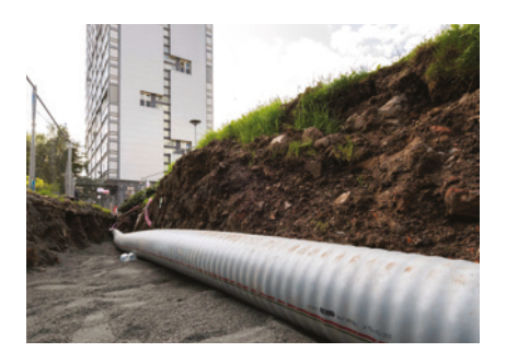
Riverside District Heating Scheme Size: Over 300 properties Product: RAUTHERMEX pre-insulated pipe