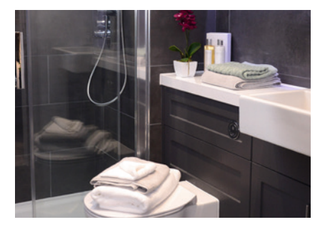
Hungate Apartments Size: Over 1,000 apartments Product: RAUTITAN plumbing