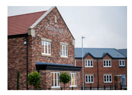
Middleton Waters housing development Size: Over 50 homes Product: Rio flush fit windows