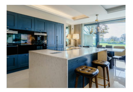
Kinnear Road Size: 15 high specification luxury apartments Product: RAUTITAN plumbing