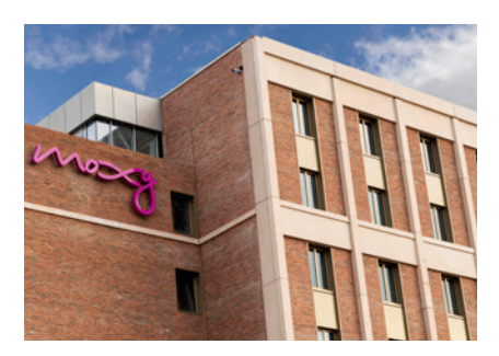
Moxy hotel, Edinburgh Size: 262 rooms Product: RAUPIANO acoustic soil and waste drainage